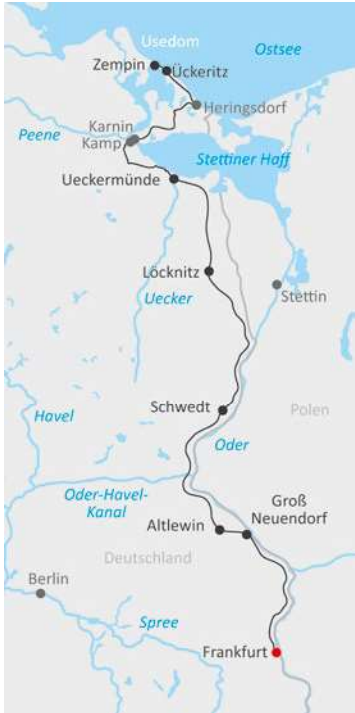
The Oder-Neisse Cycle Route from Frankfurt to Usedom